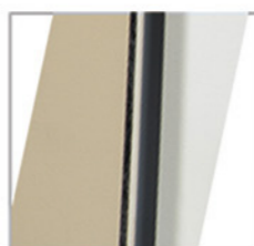
Double Layer 1.2mm sheet metal surface, melamine board inward.